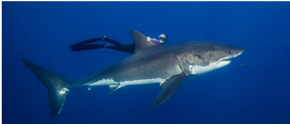
Great White Shark