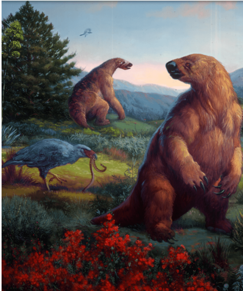
Giant Ground Sloth

Examine each picture of the modern animals and compare them to their now extinct ancestors. How have the modern animals changed over time? What similarities do you notice? What differences do you see? Why do you think these animals evolved in the way they did?