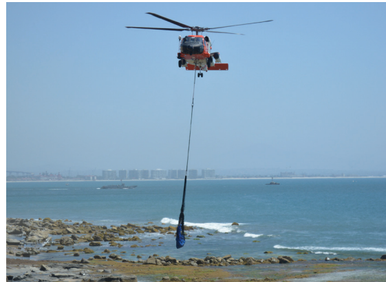
Top left: Bryde's whale found floating in San Diego Bay. Above: The U.S. Coast Guard airlifts a humpback whale skull from the beach near the Cabrillo National Monument.

The amazing thing about publication of this basic anatomical work is that it had never been done before for gray whales, in spite of the fact that gray whales have been known to science for hundreds of years. Stepping back and placing the knowledge gained from this work in an evolutionary context reinforces our understanding that organisms (including whales) carry within their bodies evidence of their evolutionary history—the retention of facial hairs in fully aquatic mammals, the retention of deciduous teeth in fetal baleen whales, the retention of vestigial pelvic bones, and the co-opting of arteries and veins originally associated with teeth to a new role supplying blood to the baleen plates.