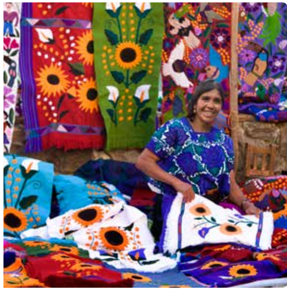
Local artisan and traditional crafts