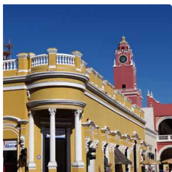
Mérida by Adam Jones

repeated pattern of 250 masks of Chaac. Following lunch, drive to nearby Uxmal, considered the most beautiful site of the peninsula because of its rich geometric stone façades. See the unforgettable Pyramid of the Magician, unique because of its oval shape, height, steepness, and heavy ornamentation, and the Governor's Palace, an imposing edifice with intricate Puuc-style stonework. Continue to Mérida and check into the five-star Fiesta Americana.