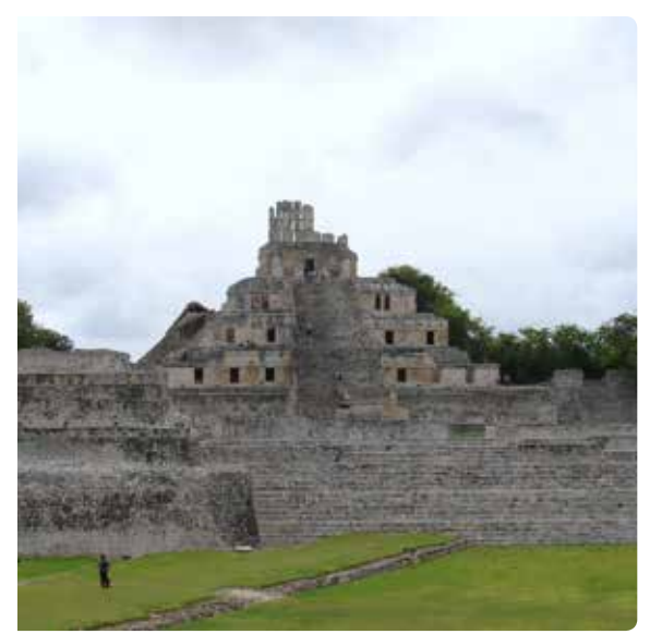
Panoramic of Edzná by El Ágora