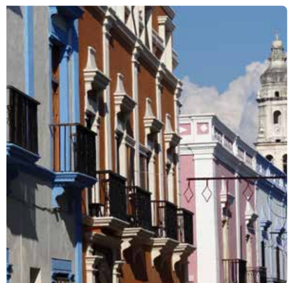
Campeche

Resort, an ecological boutique resort. Enjoy dinner together at the hotel's restaurant.