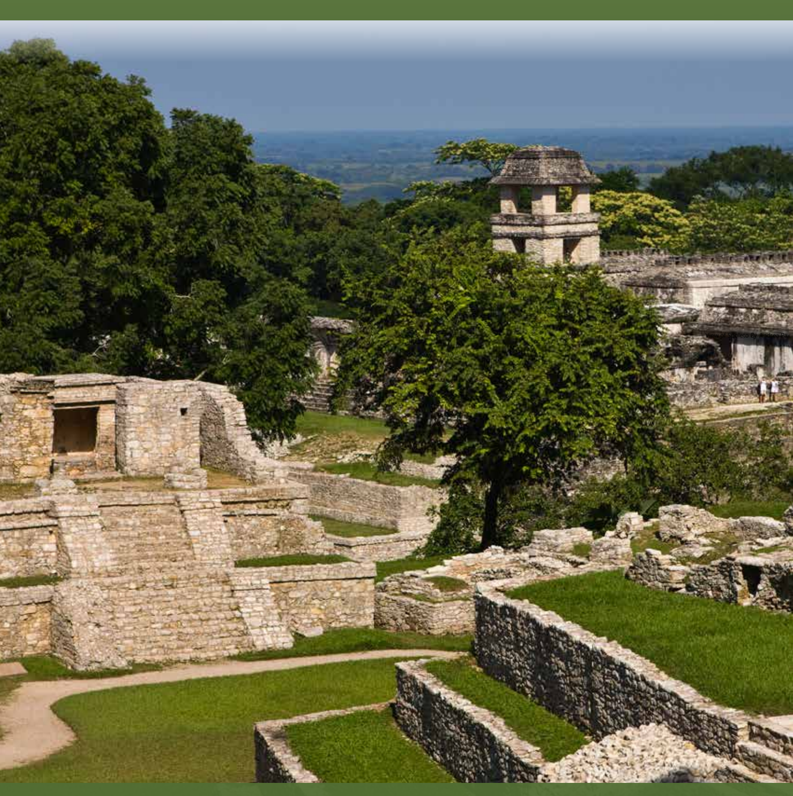
A custom-designed tour exclusively for the San Diego Natural History Museum